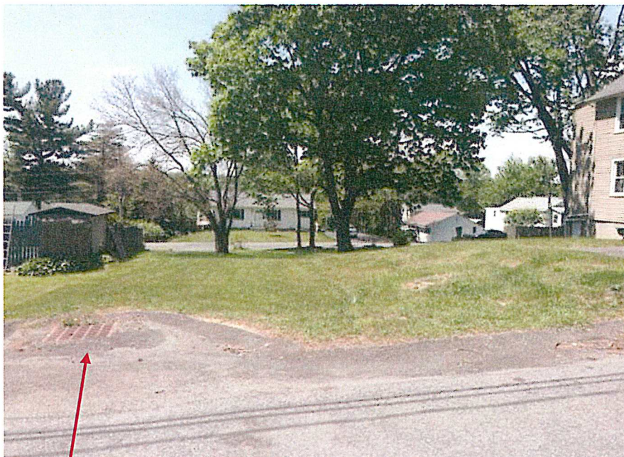
Trent Tibbitts Existing Home

In accordance with section 2.6.6 E of the EG Comprehensive Zoning Law the minimum lot width dimension is 75 ft., however this parcel falls into a pre-existing condition therefore a 60 ft. lot width is acceptable.